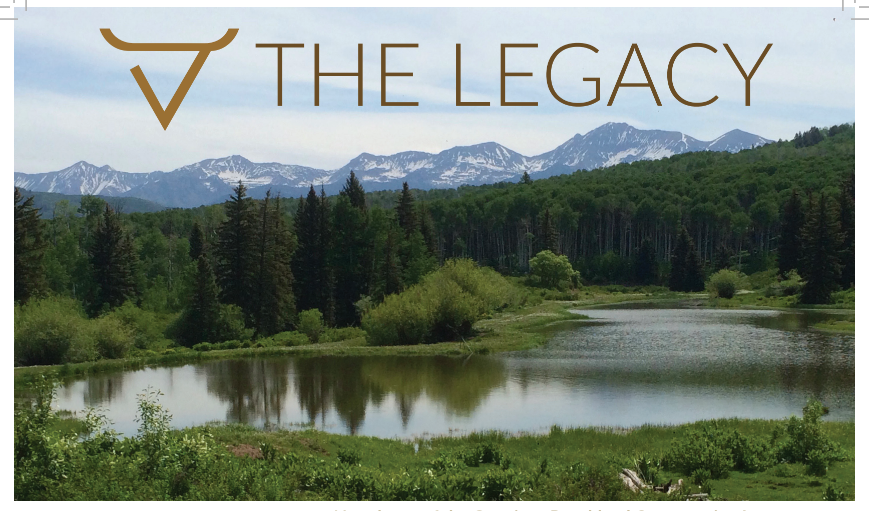
Newsletter of the Gunnison Ranchland Conservation Legacy Fall 2018