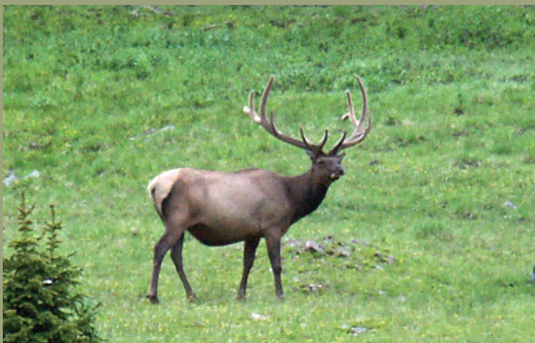
25,000 acres of elk production habitat