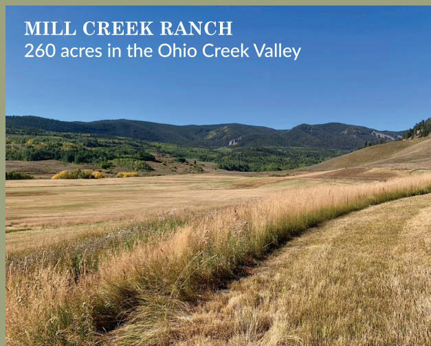
MILL CREEK RANCH 260 acres in the Ohio Creek Valley