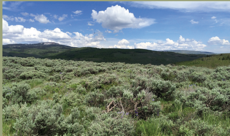
48,000 acres of grazing lands in critical Gunnison sage-grouse habitat