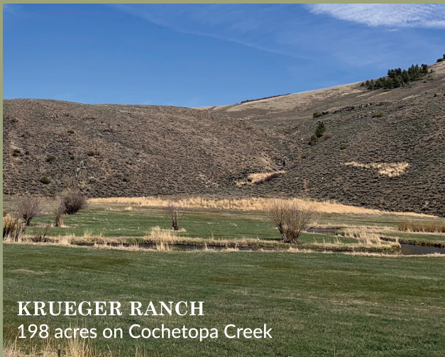
KRUEGER RANCH 198 acres on Cochetopa Creek