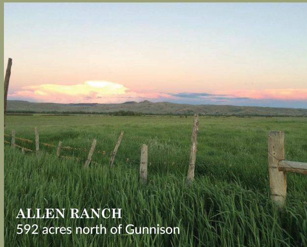
ALLEN RANCH 592 acres north of Gunnison