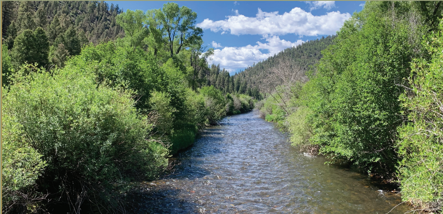
110 stream miles