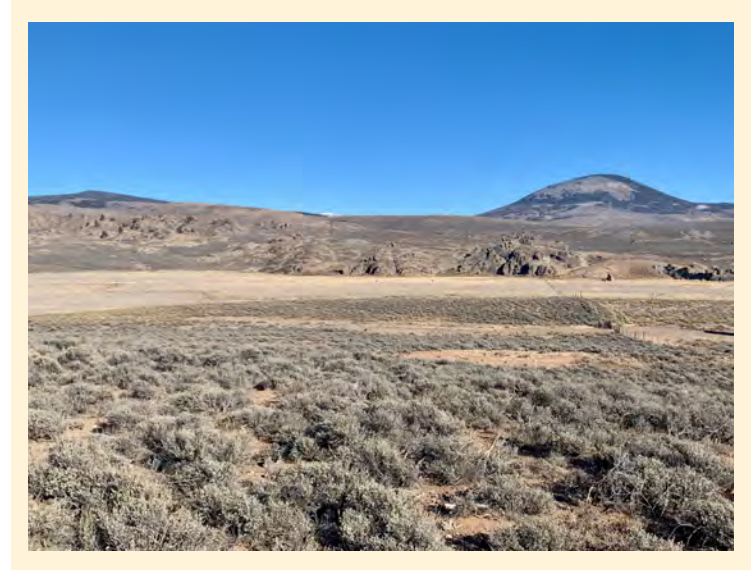
C BRANDS LAND & CATTLE The Taramarcaz Family completed a conservation easement protecting 333 acres in the Tomichi Creek Valley. The easement protects agricultural production and wildlife habitat including a stretch of Tomichi Creek and adds to the family's conservation efforts over the last 25 years. The project was partially funded by grants from the Natural Resources Conservation Service and Gunnison Valley Land Preservation Fund. Colorado Cattlemen's Agricultural Land Trust holds the easement.