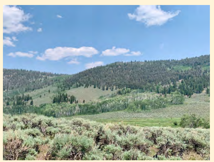
FLYING W LAND & CATTLE Jim and Claire Woodcock completed a conservation easement protecting agricultural production and wildlife habitat on 1,545 acres in the Powderhorn area of Gunnison County. This adds to more than 2,400 acres of previous conservation completed by the family in 2002. The project was partially funded by grants from the Natural Resources Conservation Service and Gunnison Valley Land Preservation Fund. Colorado Open Lands holds the easement.