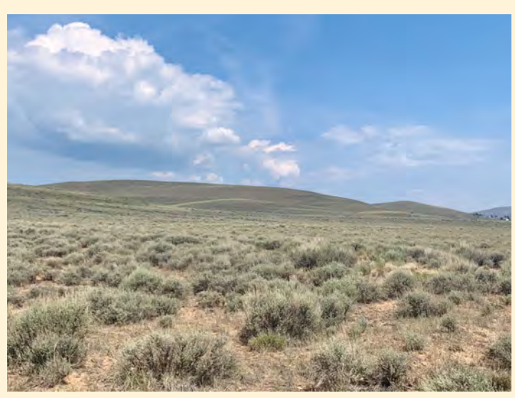
WEGERT PROPERTY Bill and Ann Wegert completed a conservation easement protecting 122 acres west of Gunnison along Antelope Creek. The easement protects agricultural production and wildlife, including important Gunnison Sage-grouse habitat. The project was partially funded by grants from the Natural Resources Conservation Service and Gunnison Valley Land Preservation Fund. Colorado Open Lands holds the easement.