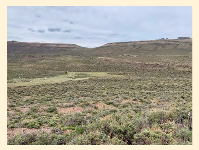
BACK 621 PROPERTY Mesa Valley Group completed a conservation easement in the Fourmile Gulch area south of Blue Mesa Reservoir. Partially conserved in 1999, the landowners donated additional acreage creating a single 621-acre conservation easement. The easement protects agricultural production and wildlife habitat including Gunnison Sage-grouse. The project was a donation by the landowners with a transaction expense grant provided by Gunnison Valley Land Preservation Fund. The Nature Conservancy holds the easement.