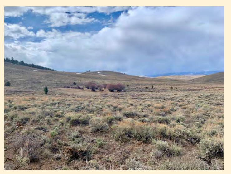
CRITTENDON PROPERTY Colten Crittendon protected 120 acres in the Powderhorn area of Gunnison County. The easement protects agricultural production and wildlife habitat including Gunnison Sage-grouse. The project was partially funded by grants from the Natural Resources Conservation Service and Gunnison Valley Land Preservation Fund. The Colorado Cattlemen's Agricultural Land Trust holds the easement.