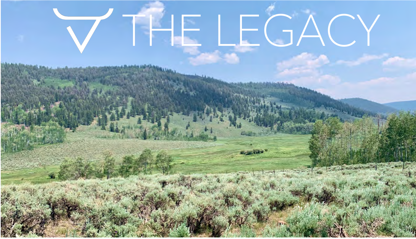
Newsletter of the Gunnison Ranchland Conservation Legacy MISSION Fall 2022 CONSERVE RANCHLANDS. PRESERVE RANCHING.