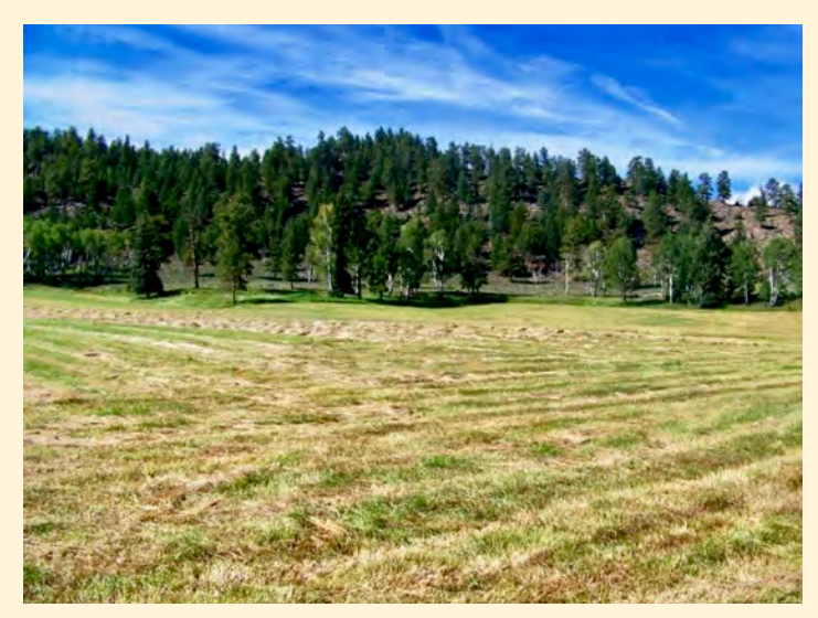
BAR IV RANCH Steve Crittendon completed a conservation easement in the Powderhorn area of Gunnison County. The 240-acre easement protects agricultural production and wildlife habitat including Gunnison Sage-grouse. The project was partially funded by grants from the Natural Resources Conservation Service and Gunnison Valley Land Preservation Fund. The Colorado Cattlemen's Agricultural Land Trust holds the easement.