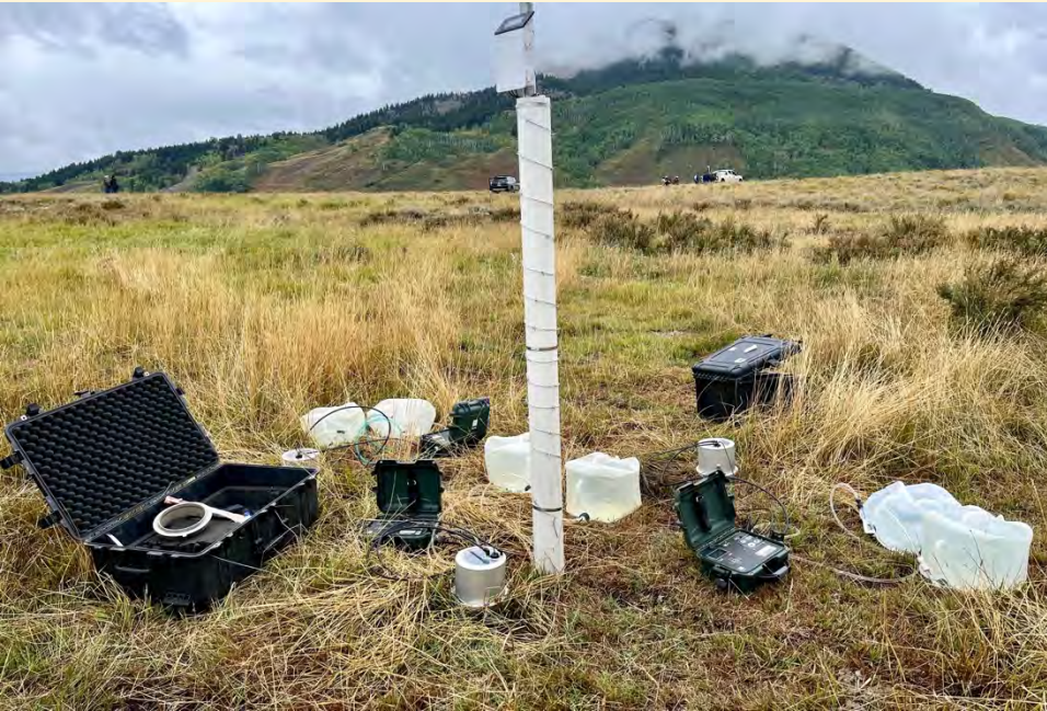
Above: MSU Institute of Water Research field testing on the ranch. Right: Researchers from CSU and Noble Research Institute taking soil samples.